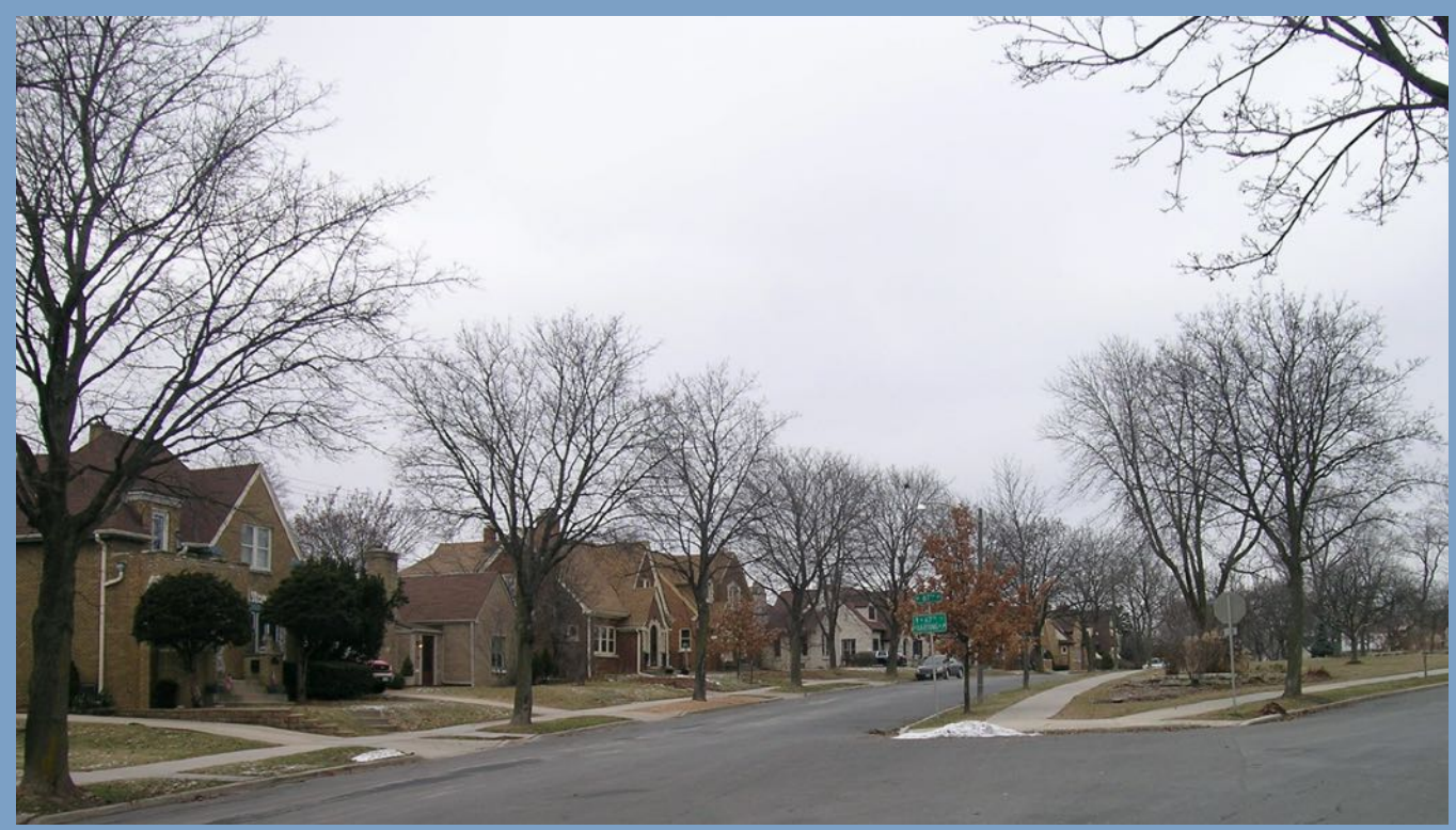
Todays neighborhood-Houses at 67th & Hadley

<sup>1</sup> Photo attribution: <u>https://upload.wikimedia.org/wikipedia/commons/5/5b/Bud_Selig_on_October_31, 2010.jpg</u>